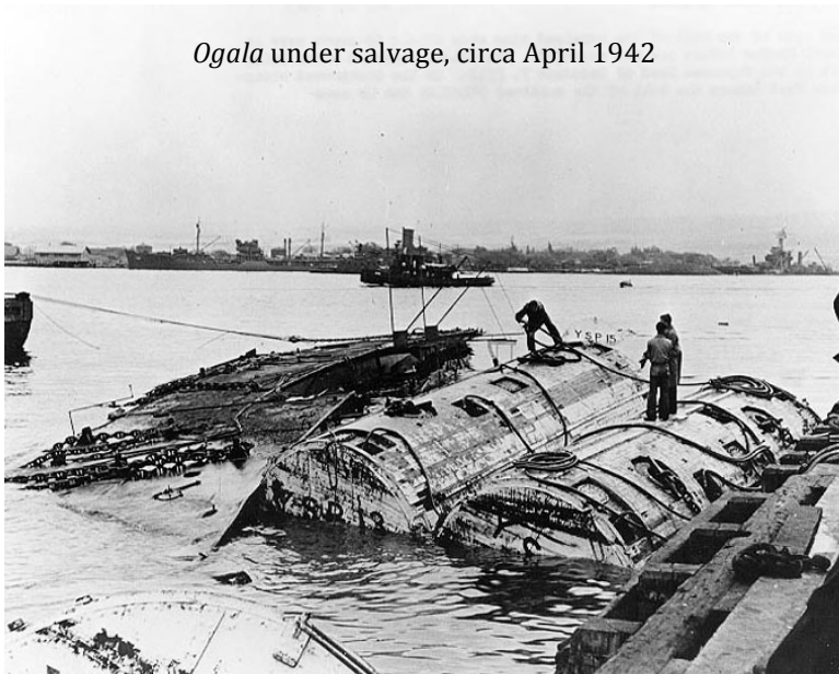
Oglala under salvage, circa April 1942

But the ship did not “die.” Even though initially the minelayer was declared a total loss, the Navy changed this evaluation. The Command decided to repair it. At Pearl Harbor, between fifteen and eighteen divers spent almost two thousand hours underwater in salvage operation on the Oglala . She first returned to an upright position in April 1942, although most of the ship still had water in it. Due to mishaps